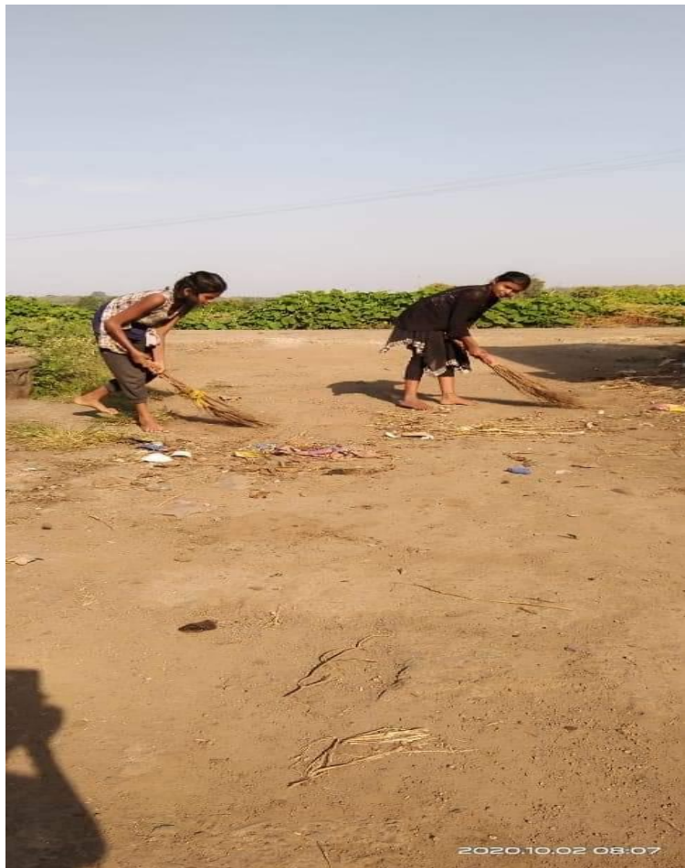
NSS volunteers celebrating Gandhi Jayanti by Cleaning Campus.