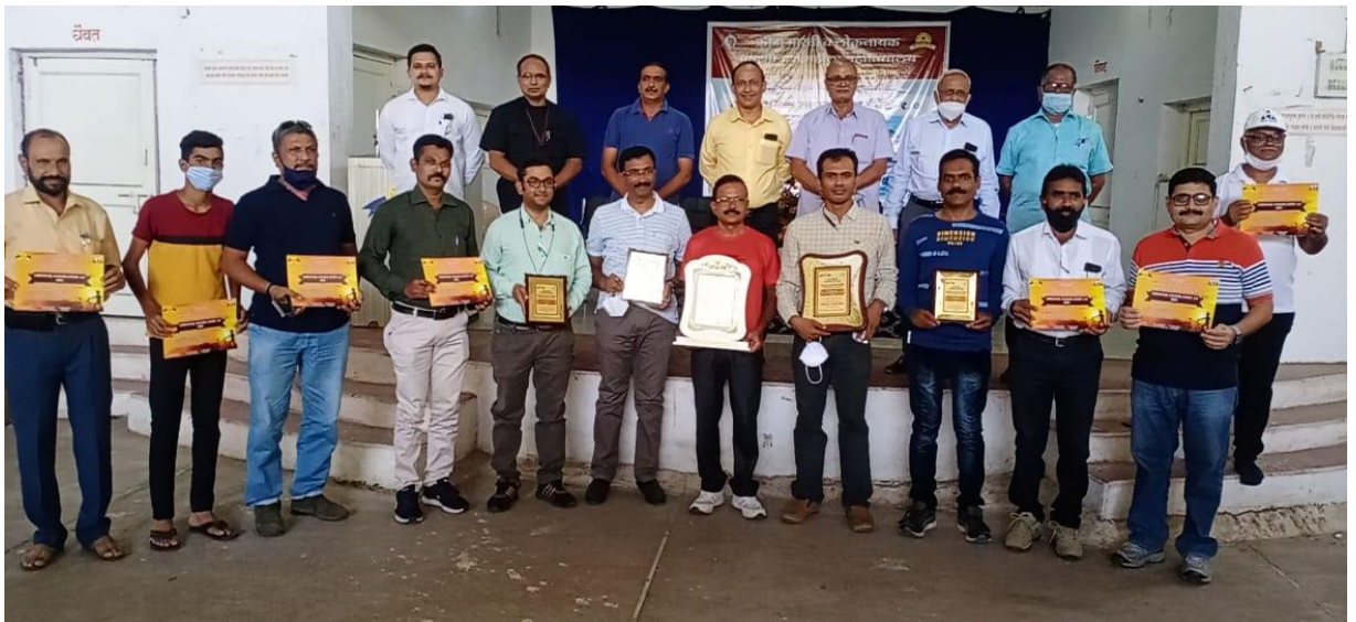
Prize Distribution of Cycle Racing Event