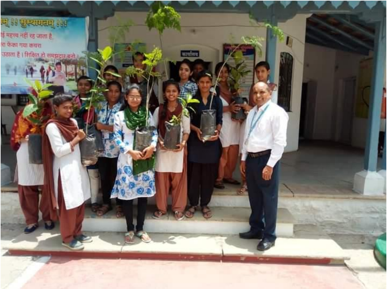
Vruksha Samvardhan Abhiyaan