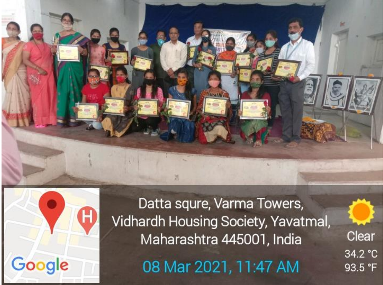
Felicitaton of Single Girl Child Parent to Celebrate International Women’s Day