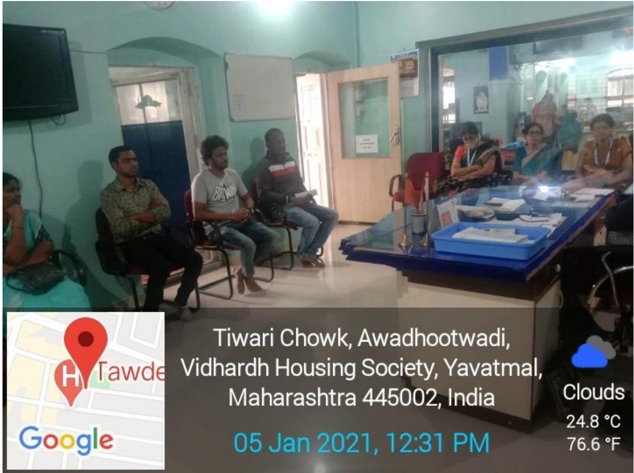
Meeting with Researchers of Ph.D.Resource Centre.